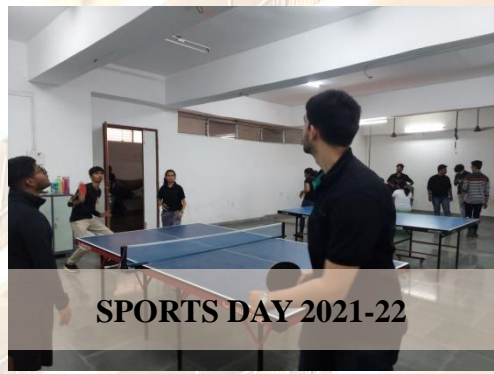
SPORTS DAY 2021-22