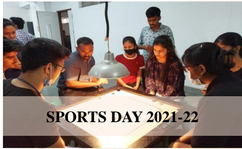
SPORTS DAY 2021-22