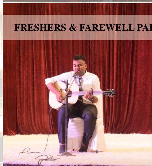
FRESHERS & FAREWELL PARTY 2021-22